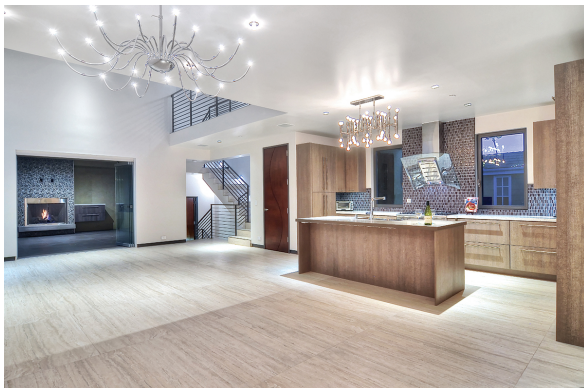
Bianco Al Contro