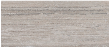
Argento Al Contro